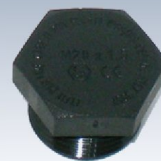
EXPLOSION PROOF Ex-E