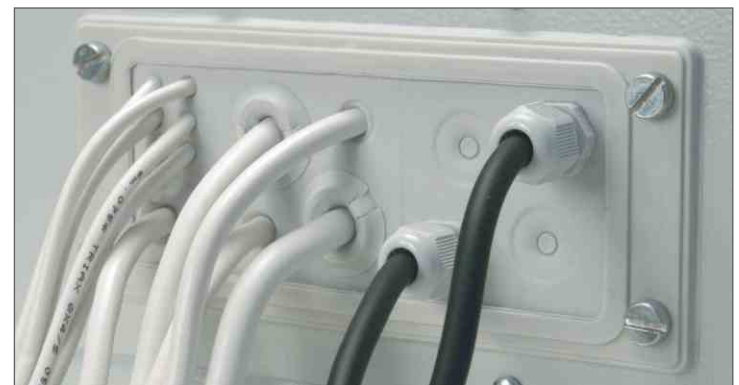
Frame Cat. No. & Dimensions